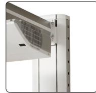
The adjustment plate allows the bar to be adjusted upward or downward by 12.5 mm.